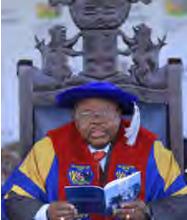
H.E Benjamin William Mkapa Chancellor, Cavendish University Uganda